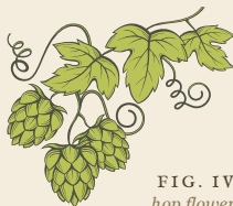
FIG. IV hop flower & bine