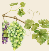
FIG. II the grape, on the vine