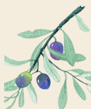
FIG. IX juniper, with berry