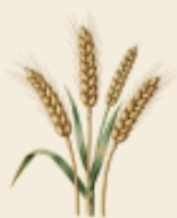
FIG. X wheat grain