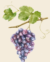
FIG. III grape cluster

from coastal pinot to bold north-coast cabs