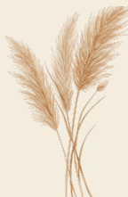
FIG. VII two-row barley