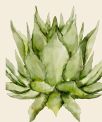
FIG. VI blue agave, in flower